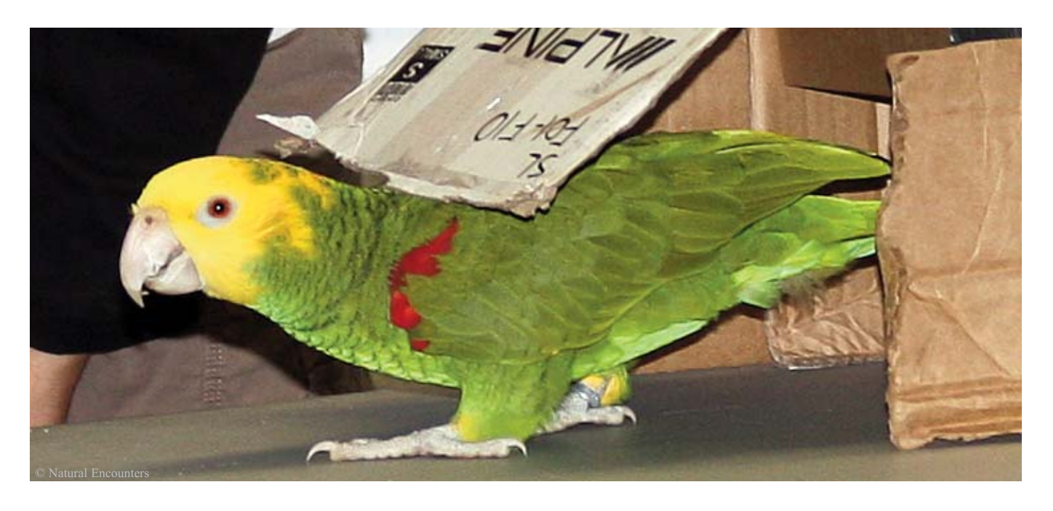
Animals like this Amazon parrot are empowered by exercising choice to solve problems and interact with novel items in their environments

when practice is distributed over many short sessions rather than less frequent, long sessions. Therefore, positive practice doesn't need to be very time consuming. A few quick repetitions a day can build and maintain behavioral fluency. One positive side effect of this approach is the strong bond that develops between the teacher and learner due to the high rate of reinforcement associated with positive practice.