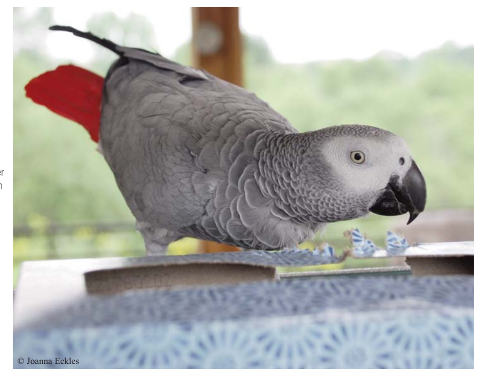
This African Grey Parrot much prefers to destroy a tissue box for hidden treats rather than to take the treats for "free" from a dish - a phenomenon called contrafreeloading.

its choice to move away. This strategy may seem counterproductive to caregivers who hope to have close relationships with their pets; however, the apparent relationship that results from forced interaction is only an illusion. True relationships are the result of choice and a preponderance of mutually reinforcing interactions – not force. The goal is for animals to choose to approach their caregivers, which can be achieved by following these teaching principles.